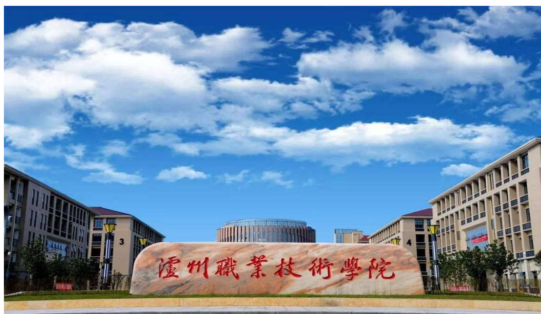
学校校门 School Gate