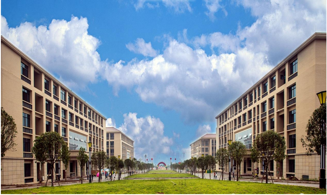
经纬大道 Jingwei Avenue