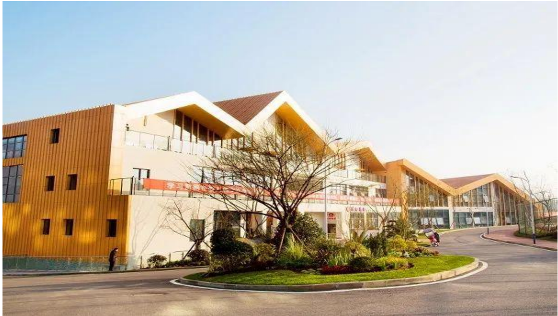
学生食堂 Student Cafeteria