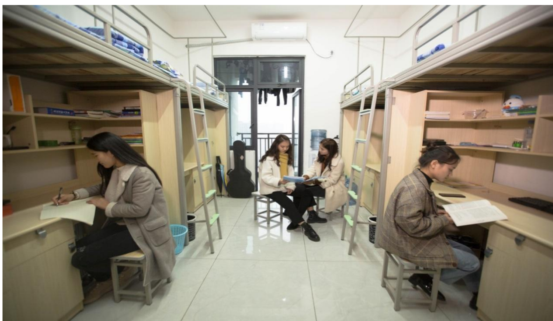
学生宿舍（四人间） Student Dormitory (Quadruple Room)