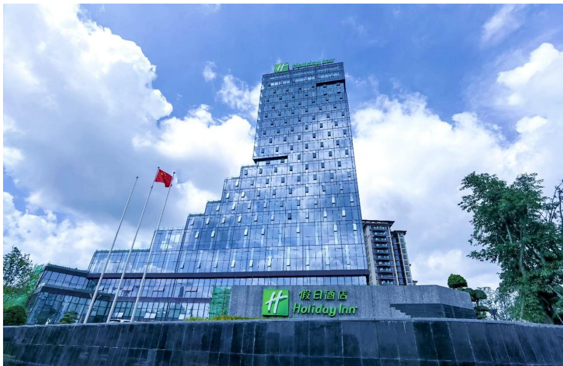
泸州龙涧假日酒店（酒店管理与数字化运营专业实训基地） Luzhou Longjian Holiday Inn (Training Base for Hotel Management and Digital Operation)