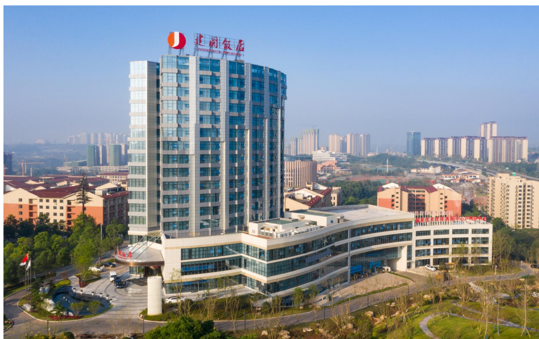
泸州建国饭店（酒店管理与数字化运营专业实训基地） Luzhou Jianguo Hotel